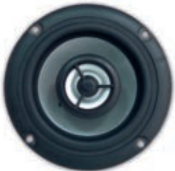
Co-axial mid-range / treble unit with 20 mm dome

The drive units of the K-series loudspeakers are based on the technologies developed for the high-end drivers used in our SOLITAIRE® and CRITERION series, but they have been further developed and modified for use in these relatively slim cabinets. We use die-cast aluminium baskets and hard cones with stiffening coatings for the bass range, while the mid-range units feature special cones with moulded stiffening patterns and excellent damping characteristics.