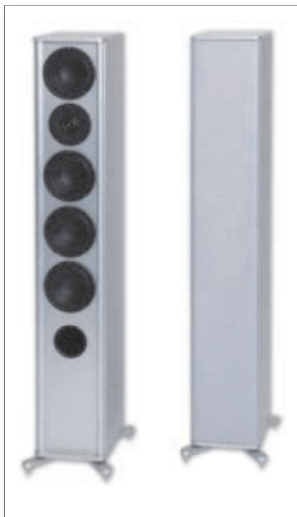
The floorstanding loudspeakers KS 300, KS 350 and KS Active are also available with cabinet and cover in Alu silver 43.