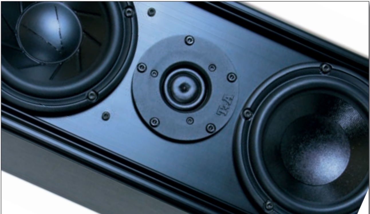
The slim design of the aluminium cabinets enables the use of relatively large drive units. The sound image is entirely detached from the cabinet itself, and the speaker's ability to radiate sound is very consistent over the full frequency range.