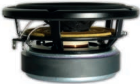
High-End bass unit with super-magnet