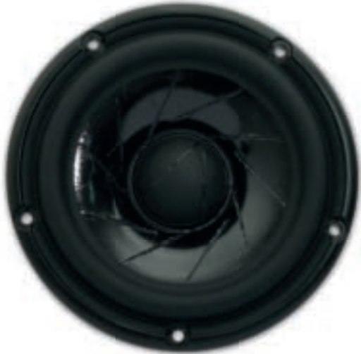
High-End mid-range unit with pressure-cast aluminium cradle