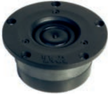
The legendary annular treble radiator