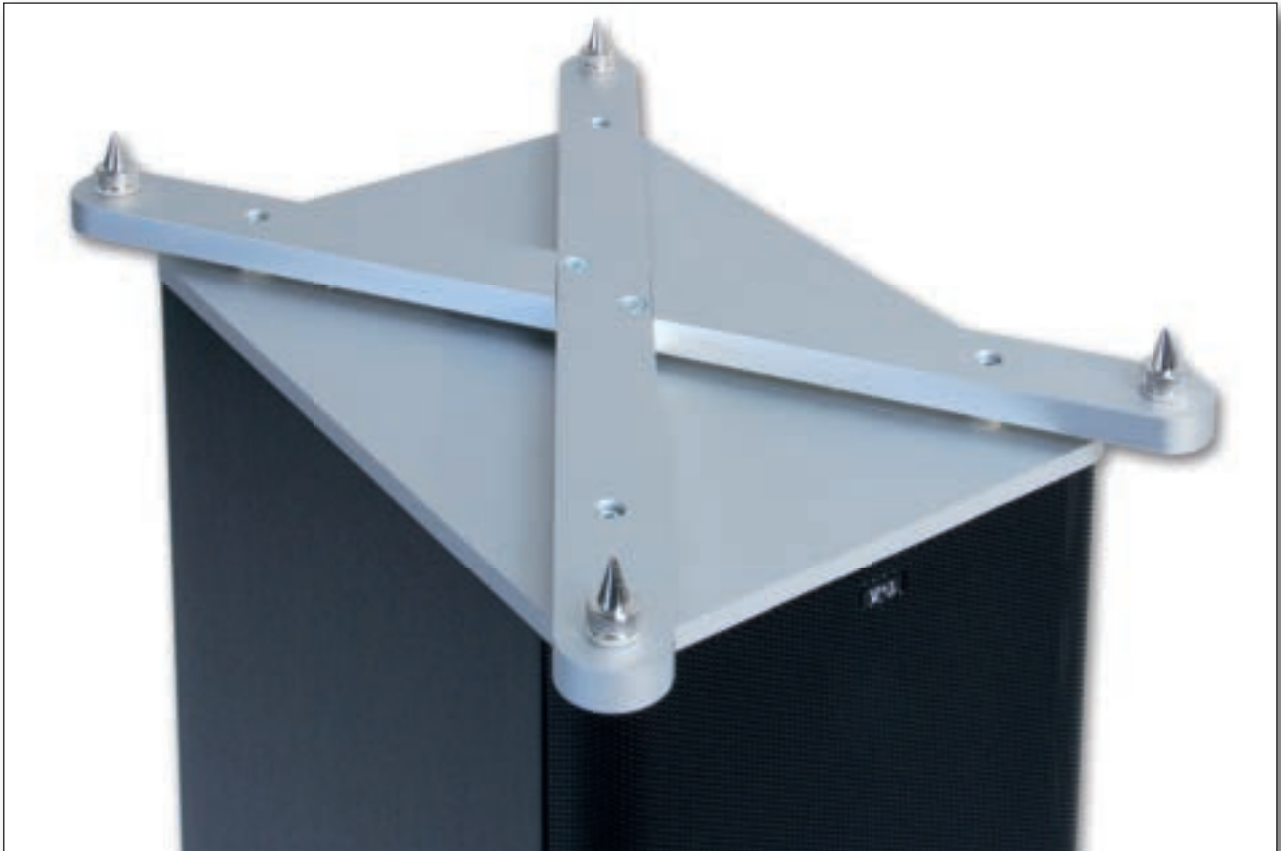
The solid cruciform bases and heavy base plates ensure that these loudspeakers are extremely stable. Optional soft glides can be fitted instead of spikes.