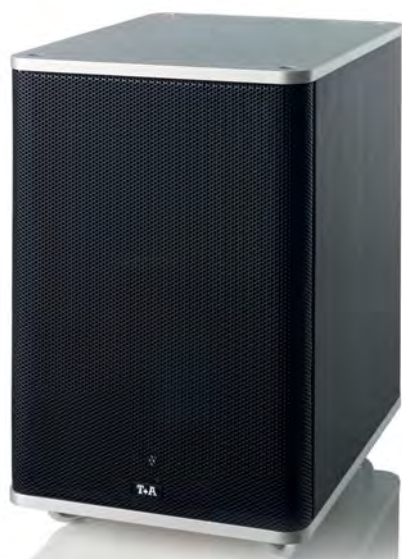
CM Active Mini